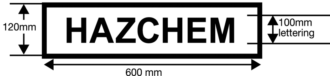
Figure 13.1 Form and dimensions of outer warning placard