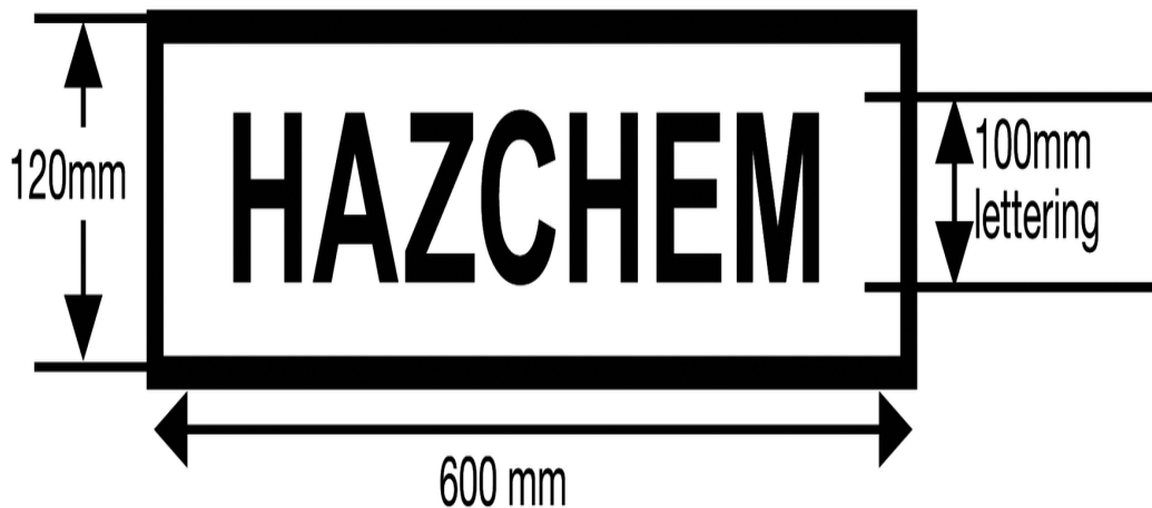
Figure 13.4 General form of placard for packaged Schedule 11 hazardous chemicals