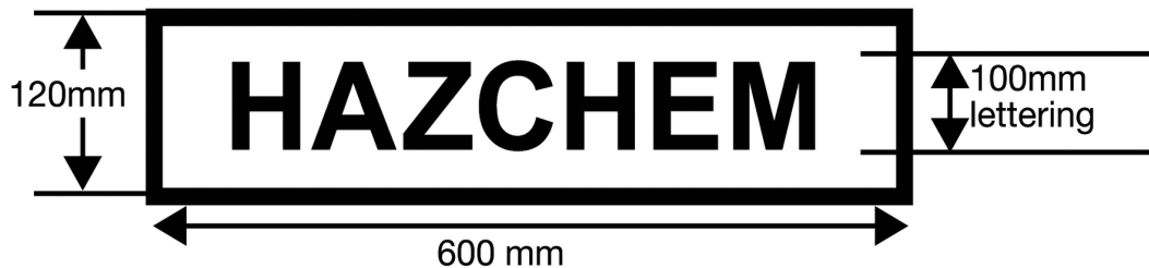
Figure 13.1 Form and dimensions of outer warning placard