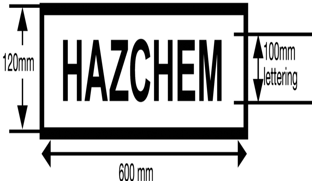
Figure 13.2 Template for a placard for a hazardous chemical stored in bulk