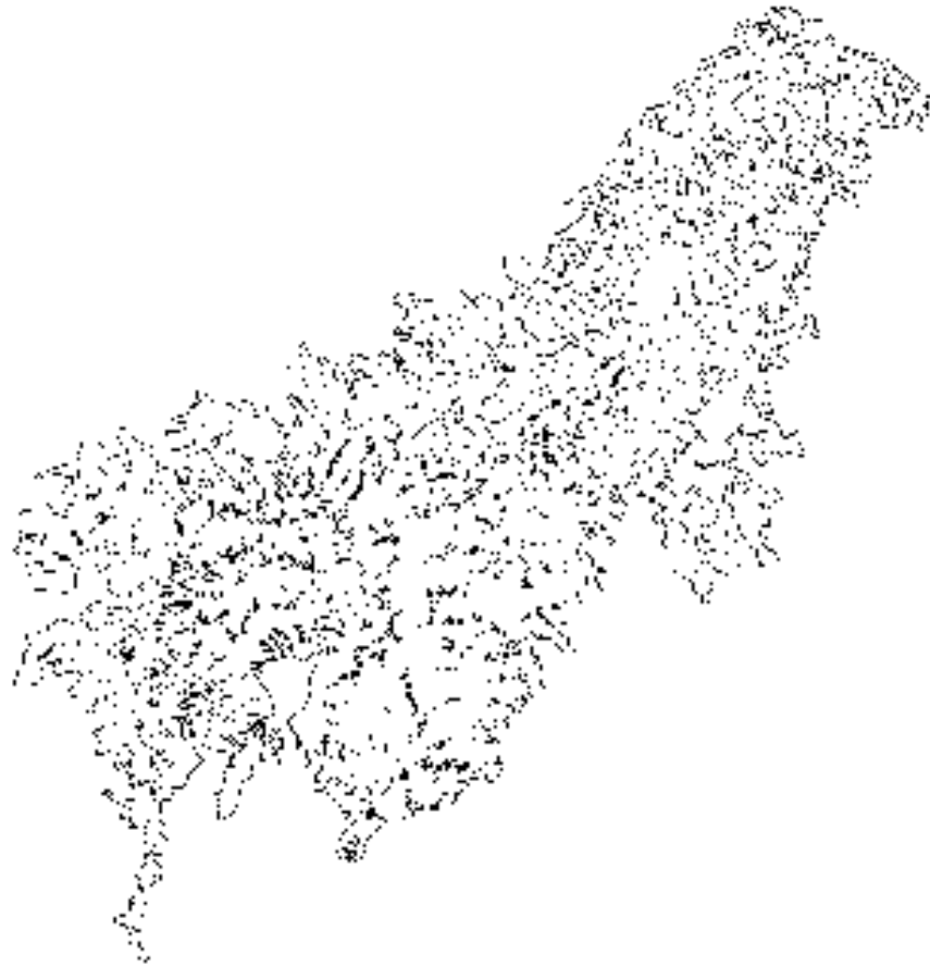
Map 5.1 High priority groundwater dependent ecosystems Legend: High priority groundwater dependent ecosystems Local Government Area boundaries State boundaries State boundaries (NSW) State boundaries (VIC) State boundaries (QLD) State boundaries (NT) State boundaries (WA) State boundaries (SA) State boundaries (TAS) State boundaries (ACT) State boundaries (NT) State boundaries (WA) State boundaries (SA) State boundaries (TAS) State boundaries (ACT)