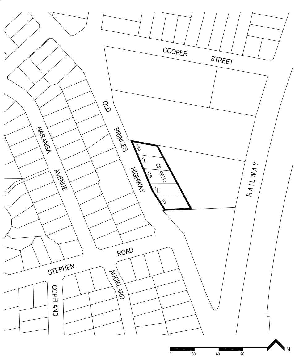
Map 10: 1150-1158 Old Princes Highway